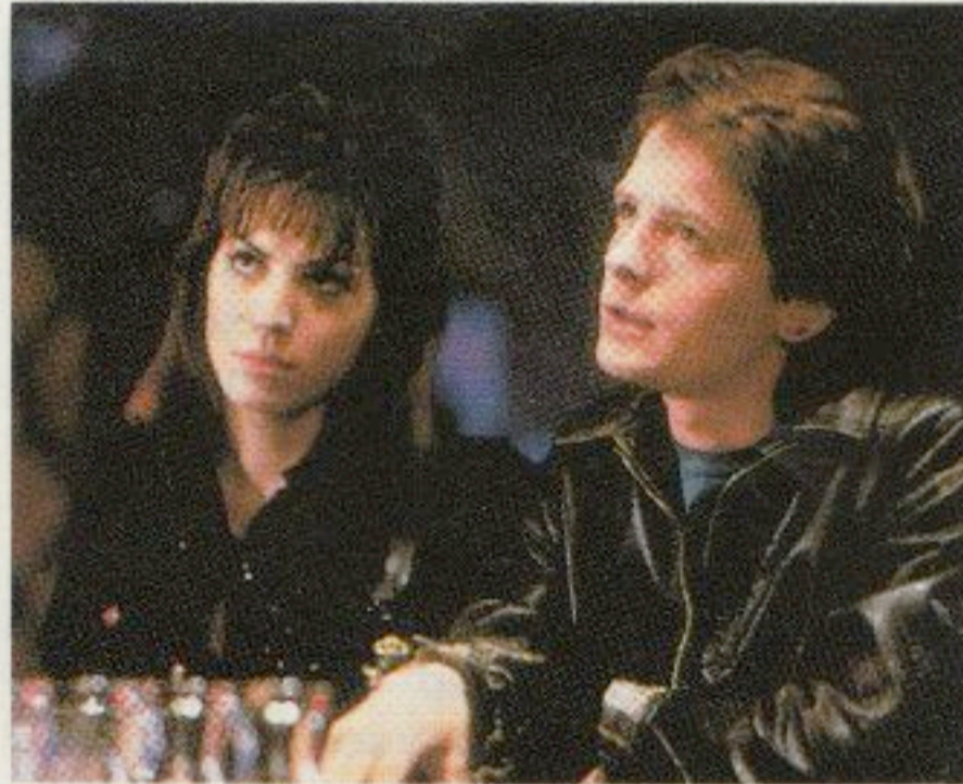
Starring with ex-rocker Joan Jett as brother and sister in Light Of Day .

FOX: I was in Florida, doing something for a children's hospital. I was staying in this old hotel that had a balcony that ran the length of the building. I could open these French doors and share the common balcony. As I was walking around in the lobby, I heard some people giggling. I figured a couple of people knew me. I went up to my room, and I got into my sweats, and all of a sudden I hear this [knocks twice on table] at my window on the balcony. I opened it expecting a couple of 15-year-old girls whom I could tell I had. . . to go to sleep. But it was 10 accountants in town for a convention. That is something weird.